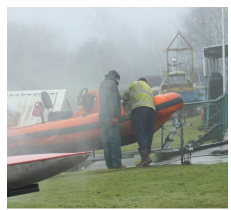
...nor is steam-cleaning the rescue boats. But all this work is essential to keep our equipment in good working order