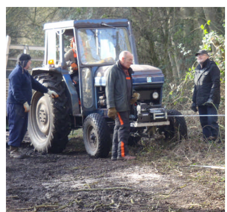
Clearing the woodland around the lake is a never-ending challenge.