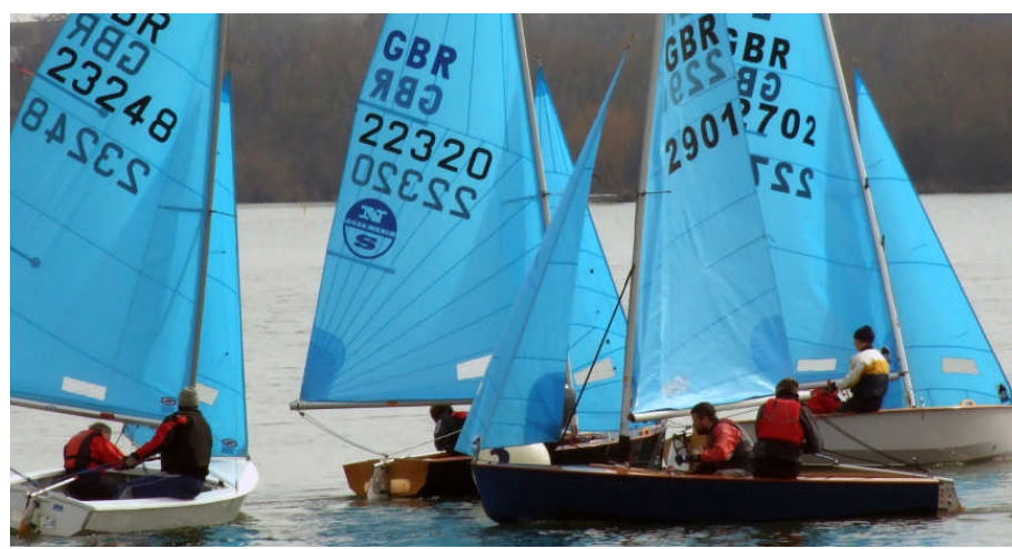
Close racing is almost guaranteed in the highly competitive Enterprise class.