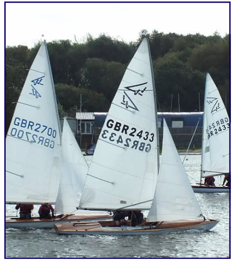
The addition of the 'Silver' class greatly increases the number of boats which can be raced in the Flying 15 fleet.