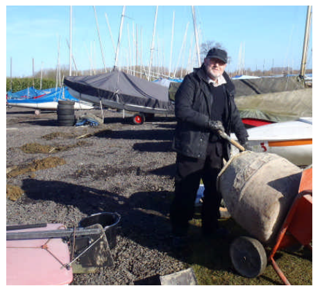
The tie-down lines are fixed to steel brackets which are set in concrete, so they won't ever blow away!