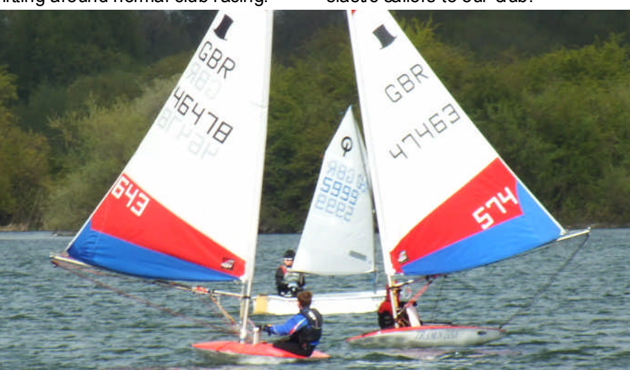
The AWS is held from April to September 2015 at MNSC, Cransley SC, Hollowell SC, Banbury SC and Northampton SC

This is the first time that the Javelin fleet has called in at MNSC and we are pleased to welcome these enthusiastic sailors to our dub.