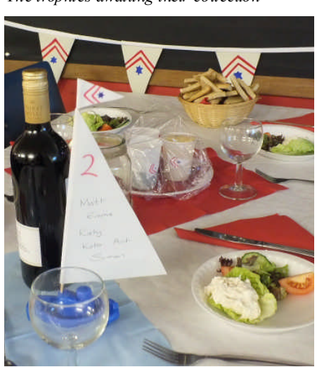
Lovingly decorated tables and a delicious dinner were prepared by the galley team.