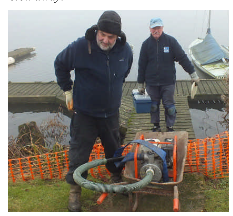
Pumping the barge out is not an easy job in lousy weather...